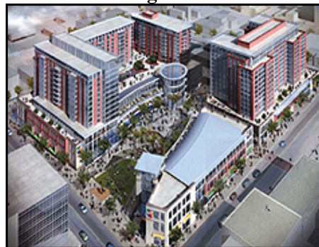
Figure 5 Flushing Commons