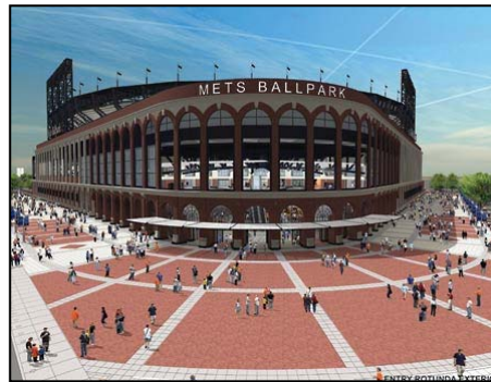
Figure 7 Shea Stadium