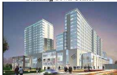
Figure 6 Flushing Town Center